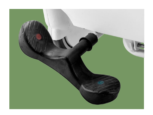
Break spring keep qualified after 10,000 times uninteruped break.