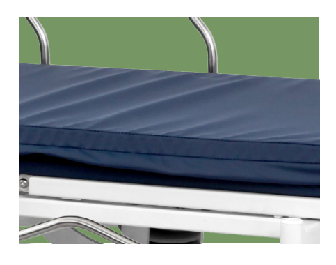
Mattress Waterproof PU mattress, convenient for transfer patient.