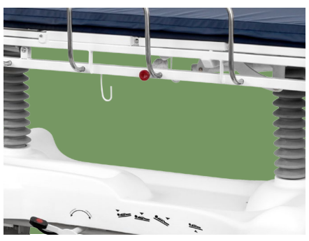
Hydraulic pumps Height adjustment, trendelenburg and revised tendelenburg through two USA hydraulic pumps.