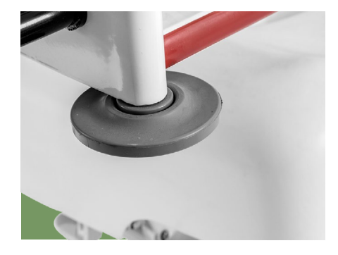
Bumper wheel Bumper wheel detachable, max. protect the bed and patient during transportation