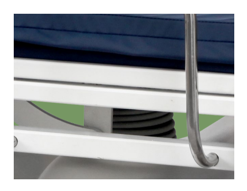
Metal material Baosteel from Fortune Global 500 Panasonic Robotic ensure 360° full smooth