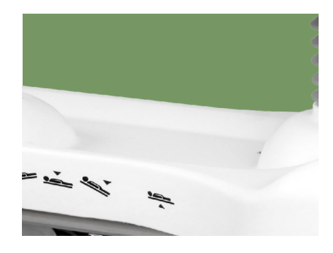
Steels | Painting 11 Process epoxy painting, ASTM testing antibaterial, paint thickness 0.12 mm, brightness 60°, paint can resist 50 kg impact.