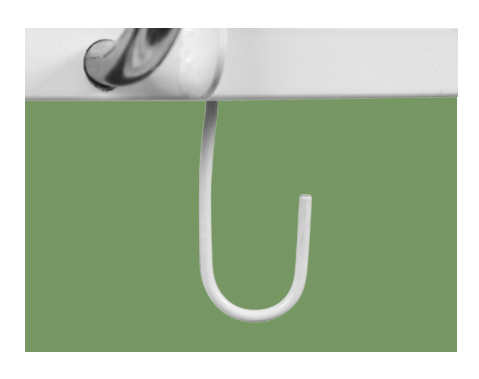
Drainage Hooks Mobile plastic drainage hooks.