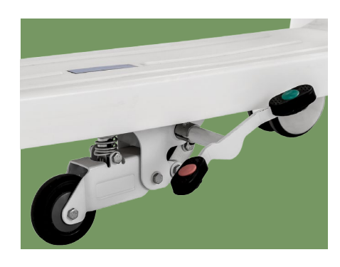
Center wheel Can be engaged to facilitate direction control, enabling users to navigate the stretcher easily in hectic and dynamic environments.