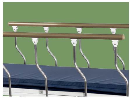
Side rail Foldable aluminium alloy guardrail